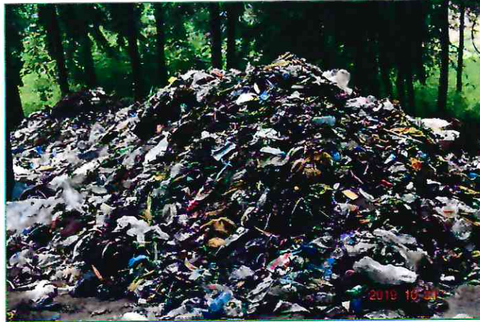
Figure 3 current state of dumpsite

the fears associated with the disposal site menace. A site in Kopoch was identified in the past but could not be relocated owing to public resistance.