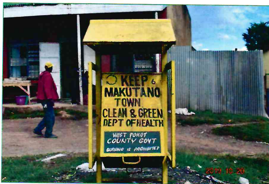
Figure 2 waste collection in Municipality

The Municipality is zoned into 17 zones which consist of Kapenguria Town, Makutano CBD, Bendera, Murkwijit, Keringet, Chepuya, Siyoi, Kishaunet, Karas, Aramaket, talau, kaiboss, Kamorow,, Sokomoko, and Lityei, Tartar, Talau, Safari hotel .In terms of frequency, daily Collection and transportation services are provided daily in zones such as Makutano CBD, Bendera and Kapenguria administrative centre. The street cleaning services which accounts for much of the municipal wastes is also provided within the Kapenguria CBD, Markets.