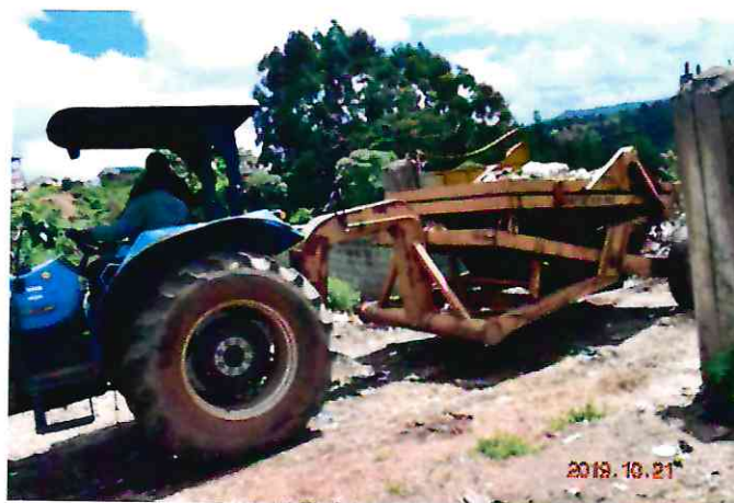
Figure 1 transportation of solid waste to dumpsite

Waste transportation is largely rudimentary using open modified tractor and only within kapenguria and Makutano townships. These poor transportation modes have led to littering, making waste an eye-sore, particularly plastics in the environment. Disposal of waste in the county remains a major challenge because the county lacks proper and adequate disposal sites. There is only one designated site which practice open dumping of mixed waste as it lacks appropriate technologies and disposal facilities.